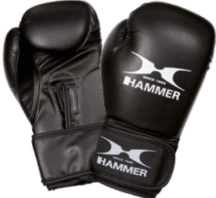
KIDS' BOXING GLOVES BLITZ Level 2 / Training

The ultimate KIDS' BOXING GLOVES are made specifically for children's hands and equipped with some of the features of the PREMIUM glove series. The preformed boxing gloves are extremely comfortable. The sweat-repellent material is robust and durable, and the outer material is made of durable PU material which guarantees long hours of training fun.