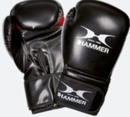
X-SHOCK Level 2 / Training

Lightweight boxing glove with high comfort and ventilation holes for better air circulation inside the glove. The flexible but stable wrist protection avoids injuries on training impact. The sewn-on thumb maintains the correct position and prevents capsule injuries. The HAMMER mesh material guarantees comfortable training conditions inside the boxing glove!