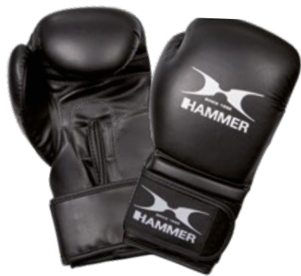
Premium FIGHT Level 3 / Fight

The ultimate leather fight boxing glove. Training under realistic match conditions while minimizing the risk of injury - PREMIUM boxing gloves are perfectly suited for this purpose. The back of the glove offers plenty of coverage, and special padding optimally protects the carpal bone. Wrist sprain injury and early tiring of the hand and forearm are therefore also reduced to a minimum.