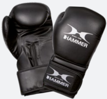
Premium Training Level 2 / Training

Perfect for beginners as well as advanced learners. The PREMIUM Training boxing gloves are made of durable PU material with many special features like the premium class glove: Pre-shaped padding, stitched-on thumbs, ventilation and a Velcro strap for wrist stabilisation. The HAMMER mesh material guarantees comfortable training conditions inside the boxing glove!