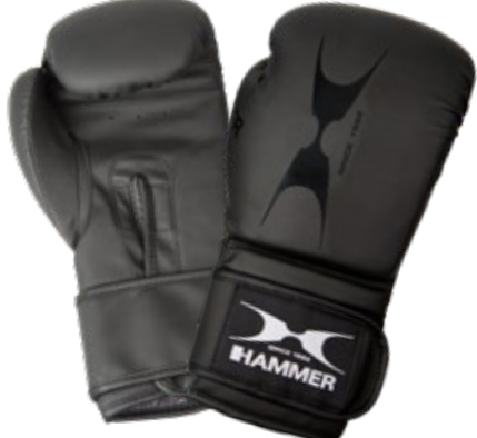
HAWK Level 2 / Training

The new black boxing glove made of durable synthetic leather provides outstanding shock absorption during all training sessions. The newly developed foam ensures a unique fit. Fully encircled wrist protection helps to avoid injuries and stabilizes the wrists during punches. Perfect for all boxers looking for a challenge.