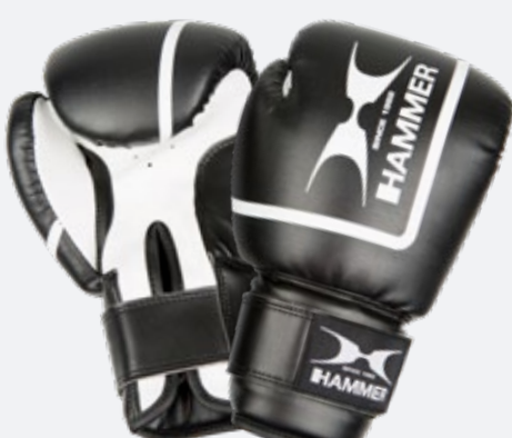
FIT II Level 1 / Fitness

Level 1 boxing gloves are perfect for training motion sequences at home. These top quality boxing gloves at unbeatable prices are perfect for beginners. They are suitable for motion training sequences as well as equipment training. FIT II stands out with its comfortable padding, sewn-on thumb and air holes.